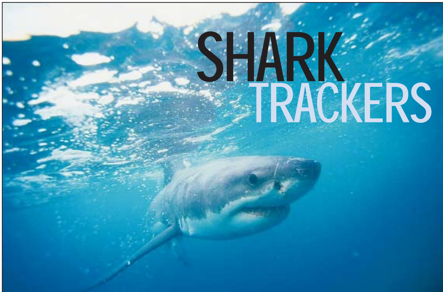
JULY 2001, OFF THE COAST OF SOUTH AFRICA

CLOSE ENCOUNTER: The movie 'Jaws' (1975) made many think that great white sharks were monsters. Today they are studied and protected.